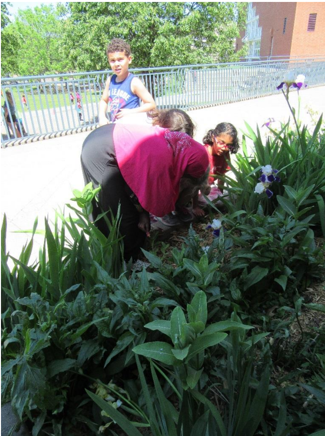
Second graders found a butterfly in the garden.

The Monarchs have arrived. Students observed what appears to be a monarch egg on the underside of a milkweed leaf. A wide variety of insects feed on milkweed and goldenrod. Evening Primrose (Oenothera Lamarckiana) puts on a show. And monarchs can be seen fluttering around the garden.