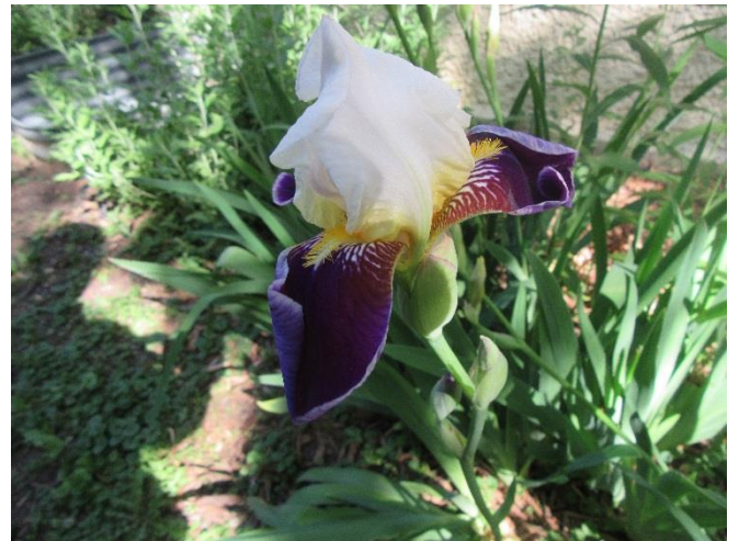
Our last week for lovely irises in bloom.