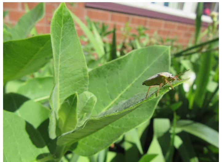
Many insect species are feeding in the garden, including this one. What kind of bug could this be?